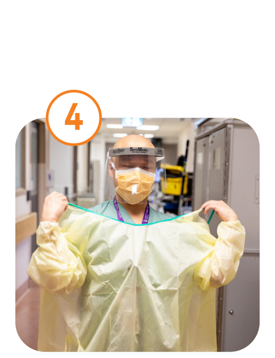
Put on gown; tie at neck & waist