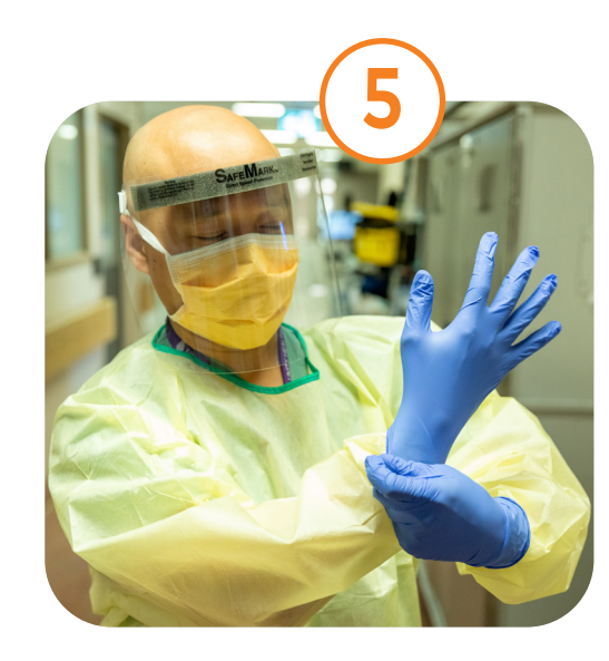
Put on gloves to cover wrists of gown