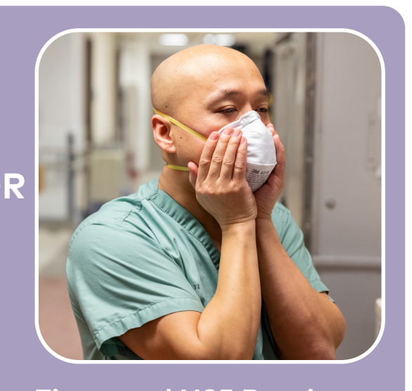
Fit-tested N95 Respirator Perform seal check by cupping hands around edges and exhale to identify any air leaks.